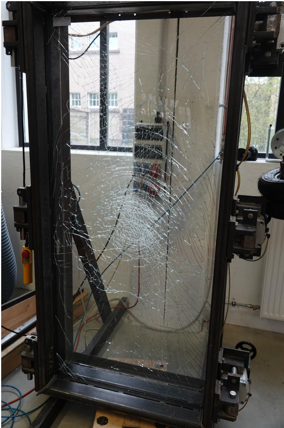
Figure 3 Specimen 2, sample fractured at a drop height of 190 mm