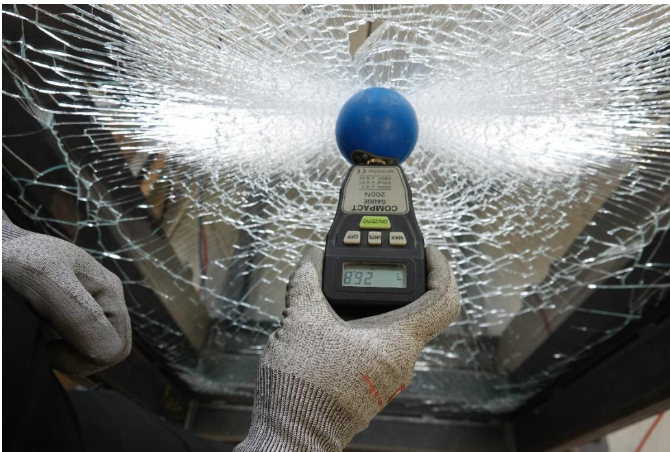
Figure 5 Specimen 4, ball puncture test with 25 N force according to DIN EN 12600 – passed