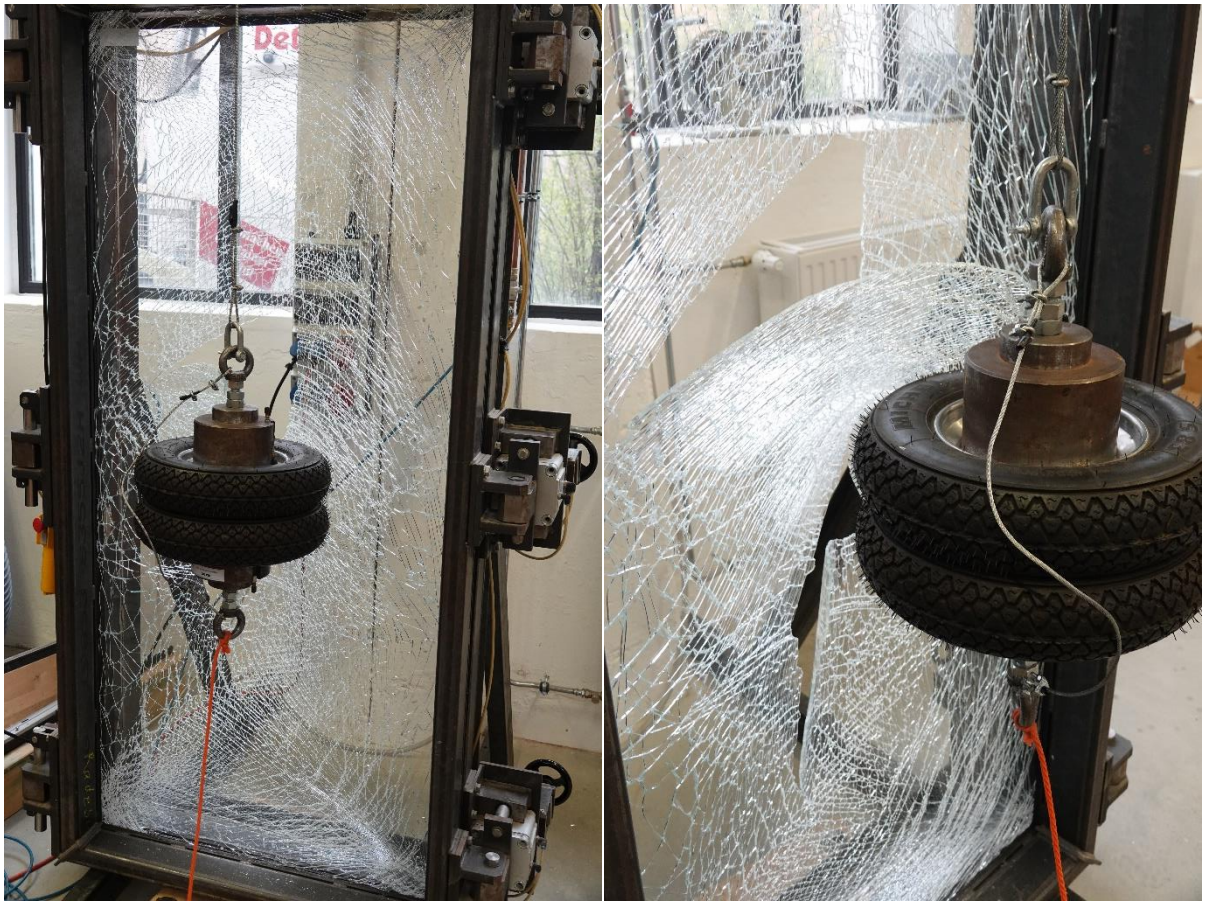
Figure 2 Specimen 1, impactor has penetrated the sample at a drop height of 1200 mm