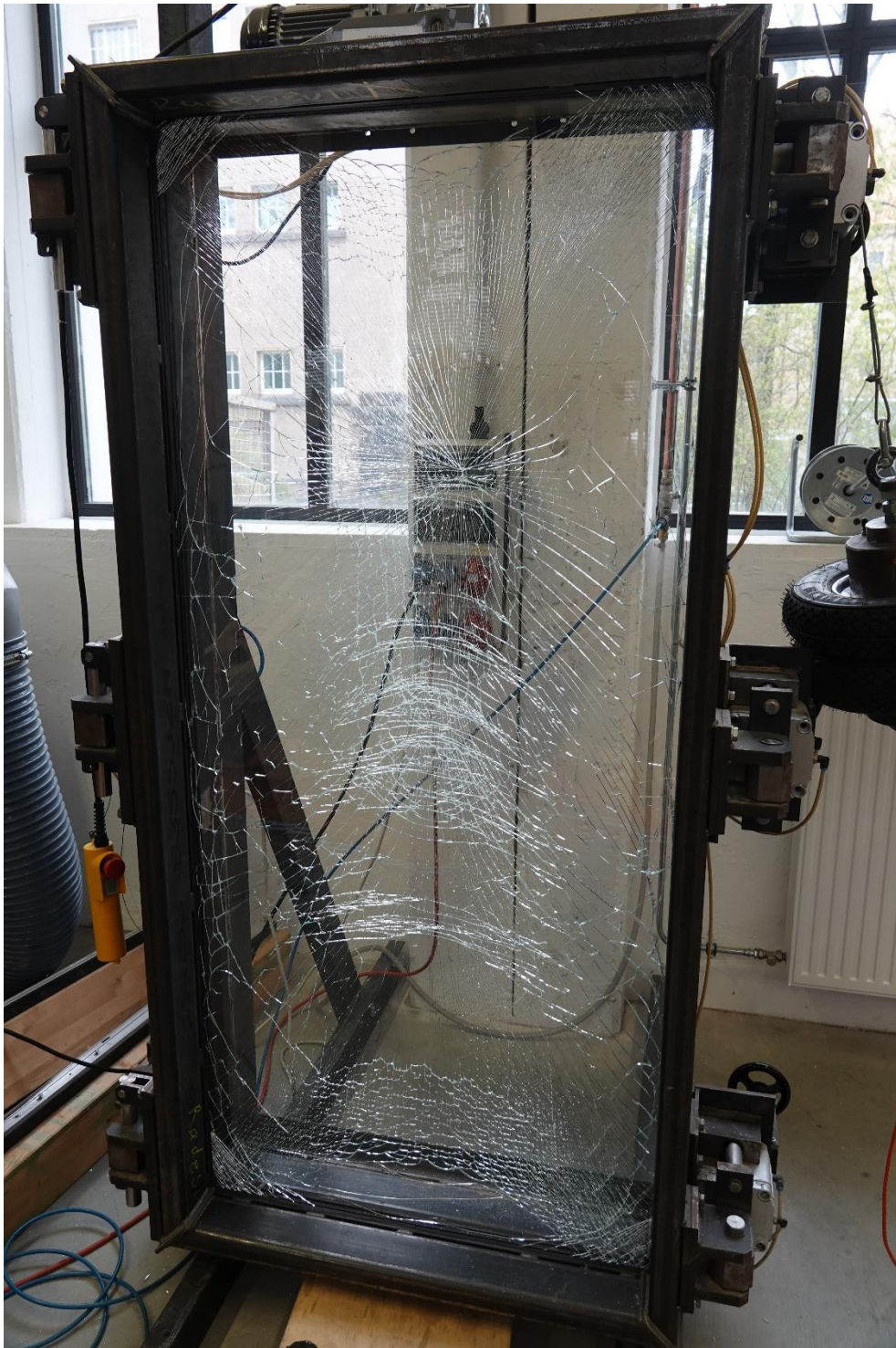
Figure 6 specimen 5, sample fractured at a drop height of 450 mm