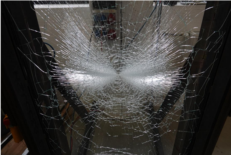
Figure 4 Specimen 4, sample fractured at a drop height of 450 mm, crack in the foil